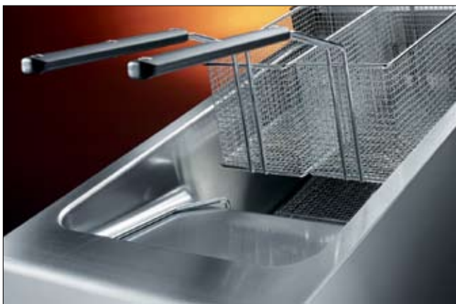
Wide oil expansion area

The Fryers in the N900 line are distinguished by their excellent performance and remarkable efficiency. The design of the pressed well with a V- profile in stainless steel with a wide expansion area for the oil, also allows optimum heat exchange and so the oil lasts longer. The heating elements on the outside of the well, the rounded corners and the absence of welded points thanks to the laser welding profiles that make them extremely easy to clean, meeting the strictest standards of hygiene. The operating temperatures range from 120°C to 190°C for the gas models and from 105°C to 190°C for the electric models. The waste oil is collected in a bowl, by an integrated drain system which is positioned on a trolley for the Active and electronic models with oil recycling. This simplifies all the management operations of waste oil and guarantees the safety of the operator. The stainless steel burners are provided with a thermocouple safety valve for the gas models while the electric models have Incoloy 800 reinforced elements (models with 18 litre well) and the radiant hotplate elements (models with a well from 15 to 23 litres) are provided with a safety thermostat. Piezo ignition.