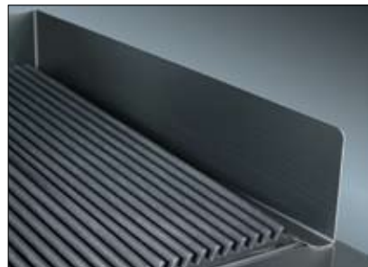
Cast iron grid