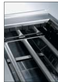
Stainless steel burners