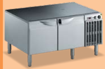
Refrigerated Base Unit

The absence of joins, precise finishing, knobs tight against the control panel, the large pressed surfaces and the cantilever solutions are just some of the technical-design solutions that make it easy for operators to adhere to the safety and hygiene criteria in the working environment. Furthermore, the new modern design and extreme modularity of the line offer an infinite range of solutions that are always extremely functional and elegant. All appliances in the N900 Zanussi Professional line are produced according to the strictest safety and hygiene standards and approved by the main national and international bodies and are CE marked