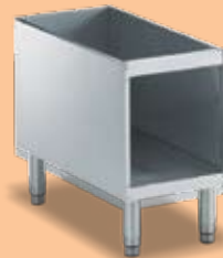
Neutral Base Units