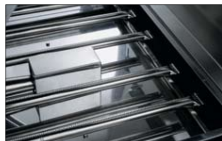
Chrome plated burners