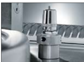
Air release device