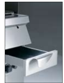
Large grease collection drawer