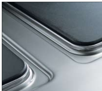
Smooth pressed top

The electric ovens also provide maximum level performance with a power of 6 kW and an operating temperature from 110°C to 285°C. Sturdiness and easy cleaning are guaranteed by the cooking chamber that is entirely in stainless steel. Insulation is guaranteed by the 40 mm thick door. The oven is supplied with stainless steel runners that are fixed in order to hold GN 2/1 pans. For improved ergonomics the oven knobs are positioned on the upper control panel. The cast iron ribbed surface guarantees uniform cooking. The humidity check valve always ensures perfect cooking. 3 cooking cycles are available, radiation from below, grilling and combined.