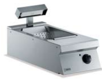
1 electric top