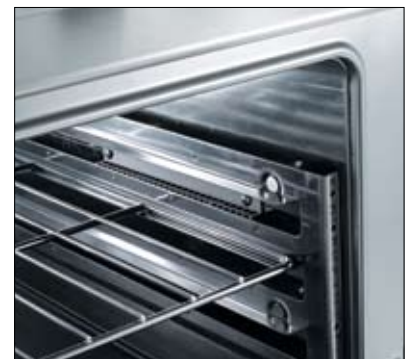
Stainless steel oven