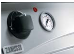
Control panel with manometer