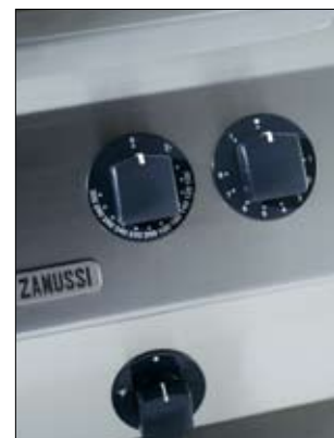
Control panel knobs