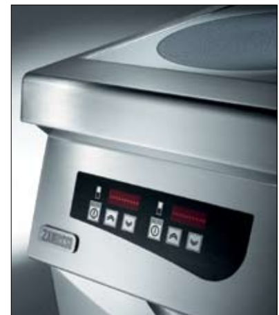
Digital control panel and ceramic glass top