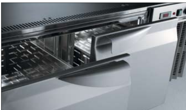
Large drawers on telescopic runners. on a refrigerated base