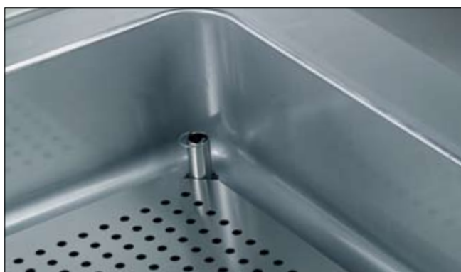
Well with perforated false bottom and overflow pipe

The N900 Bain-Maries are provided with automatic temperature control by an adjustable thermostat from 60°C to 90°C. The wells, with rounded corners and edges to make cleaning and drainage easier, can hold GN food containers with a height of up to 150 mm and with GN 1/1 + 1/3 dimensions. The bain-maries are also provided with a perforated false bottom and a support which can be moved to hold food containers. The water drain is supplied with an overflow pipe. The optimized combustion burners have a thermocouple safety valve and a protected pilot flames.