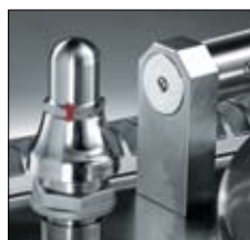
Safety valve for pressure in the jacket