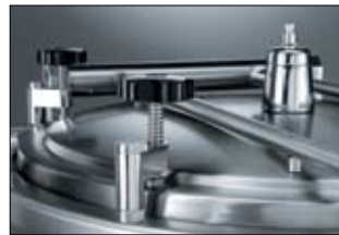
Autoclave lid with safety valve

Gas or electric models, 250 litres, rectangular with indirect heating