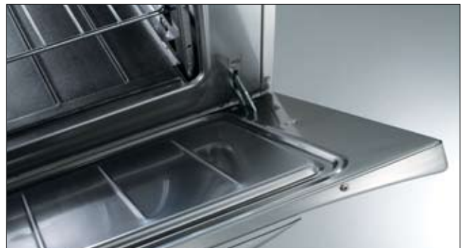
Oven with rounded internal corners