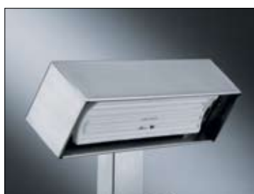
Infrared heating light

The Chip Scuttle, which is indispensable for salting and keeping all fried foods at a constant temperature after cooking, has a 316 AISI stainless steel well. It is provided with an infrared heating light positioned in order to uniformly distribute heat, a bowl with rounded corners and a perforated false bottom that is removable for easy cleaning and it has a wide front expansion area to make loading/unloading operations easier. The power available is 1 kW.