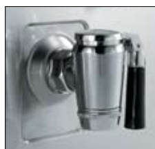
Tap with retractable handle