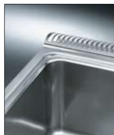
Well with rounded corners