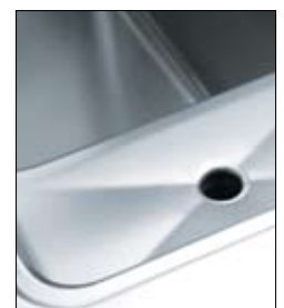
Overflow zone with drain hole