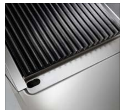
Grease collection drain