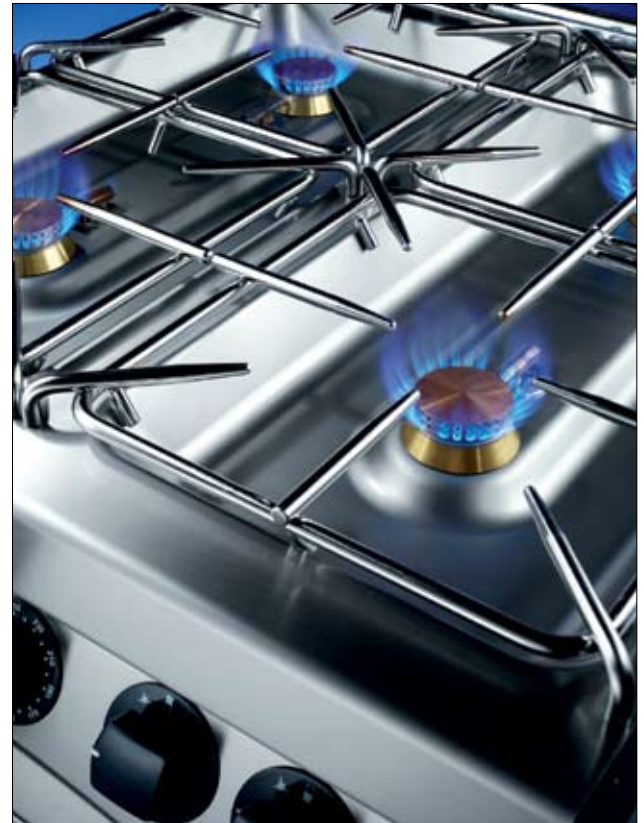
High powered Flower-flame burners