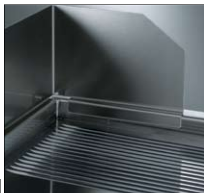
Built-in cooking plate with splashback