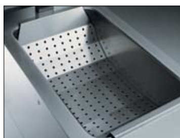
Removable perforated false bottom