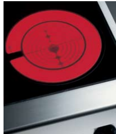
Two concentric cooking zones