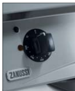
Temperature control knob