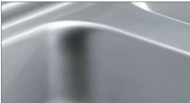
Smooth pressed top