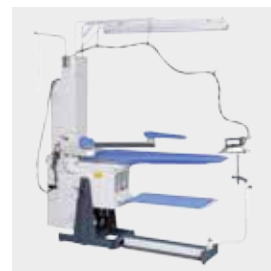
FIT2WC ironing table