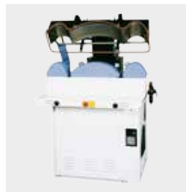
FPA6-WC collar and cuff press