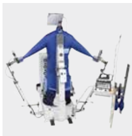
FFT-S form finisher