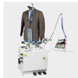
FFT-D form finisher