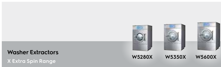
Washer Extractors X Extra Spin Range