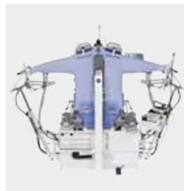
FSF2 shirt finisher