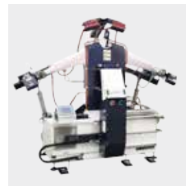
FSF3 shirt finisher