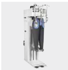
FTT1 trouser topper