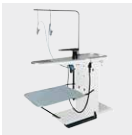
FSU1 spotting table

A wide range of options and accessories (trolleys, bases, condensing units, etc) is also available, ask our local offices!