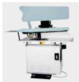
FPA3-D leg shape press