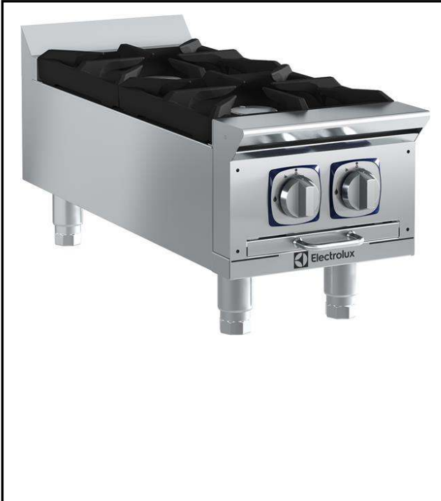
169130 (ACG12T) EMPower Two (2) Burner Top, Gas, Thermoc

2 Open Gas Burner Top with Safety Thermocouple EMPower